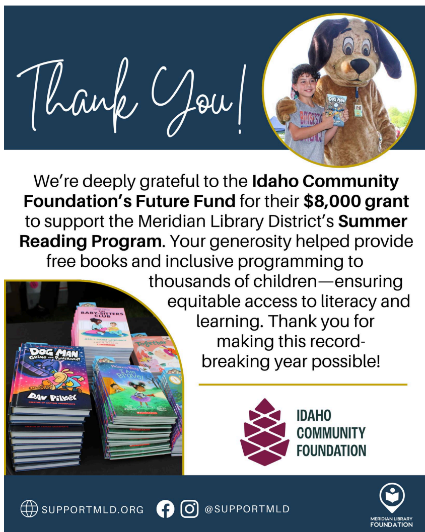
Image: Social media graphic used to publicly announce the grant award

Awarded in response to a funding request outlining the need for continued youth access to books amid budget constraints, the grant helped expand literacy resources and reduce summer learning loss, particularly in underserved areas.