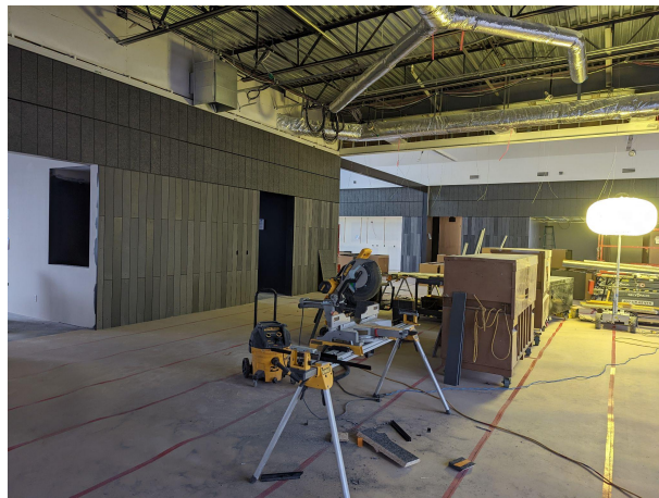
Cabinetry delivered and installers will begin work in November