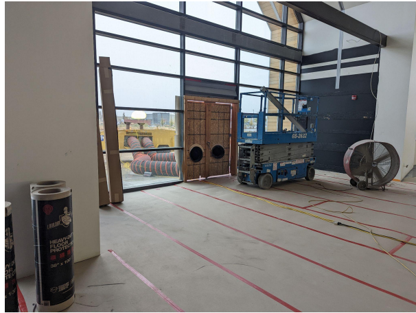
Exterior heater on north end until the gas meter is installed